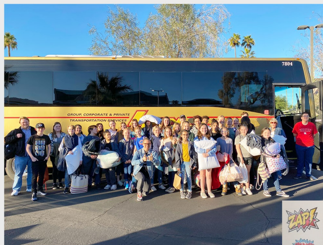
FOREST HOME WINTER CAMP